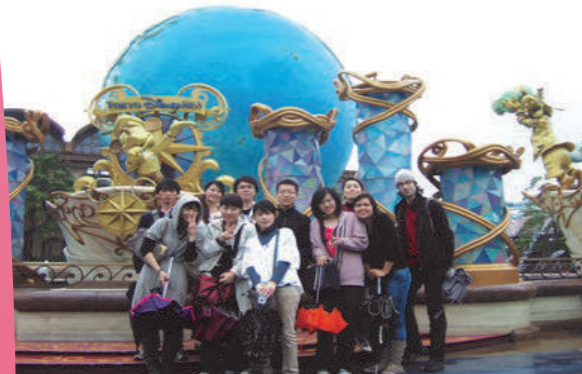
Tokyo Disneyland / 東京ディズニーランド