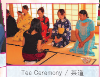
Tea Ceremony / 茶道