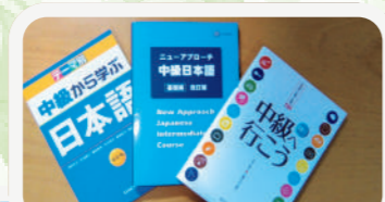
Intermediate / 中級