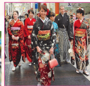
Kimono Dressing / 着付け