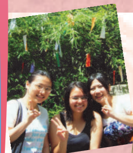
Star Festival / 七夕