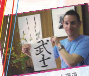
Calligraphy / 書道

着付け、茶道、書道、和太鼓、風鈴作り、陶芸等、日本の伝統文化を体験します。また、時期によっては相撲鑑賞及び稽古部屋見学や歌舞伎を鑑賞します。※項目によって、最低催行人数あり。