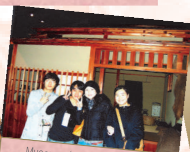
Museum / 江戸東京博物館