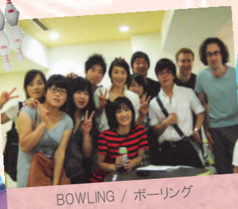
BOWLING / ボーリング