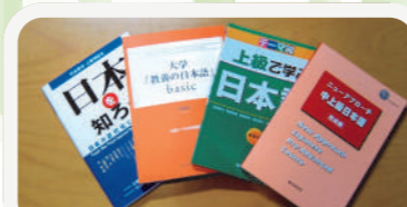
Advanced / 上級