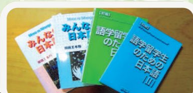
Beginner / 初級

UJS will inform the pre-examination results to the applicant