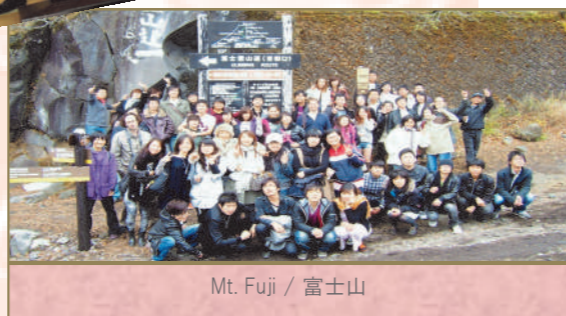
Mt. Fuji / 富士山